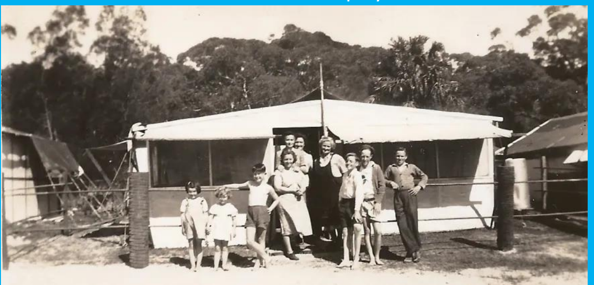
Shacks of the Royal National Park

The library had a collection of oral histories with people from the Bonnie Vale community as audio files hosted on our Illawarra Stories website. They can be downloaded or streamed. We linked these via QR codes displayed in the exhibition.