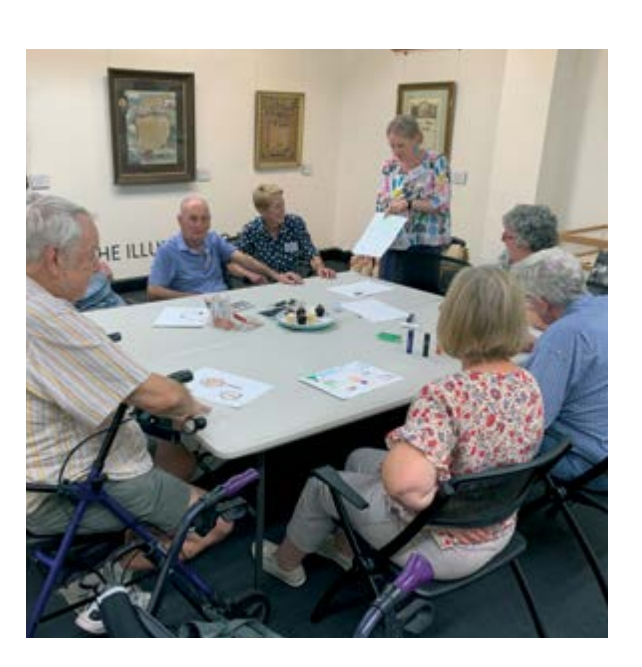
Participants engaging in an art activity