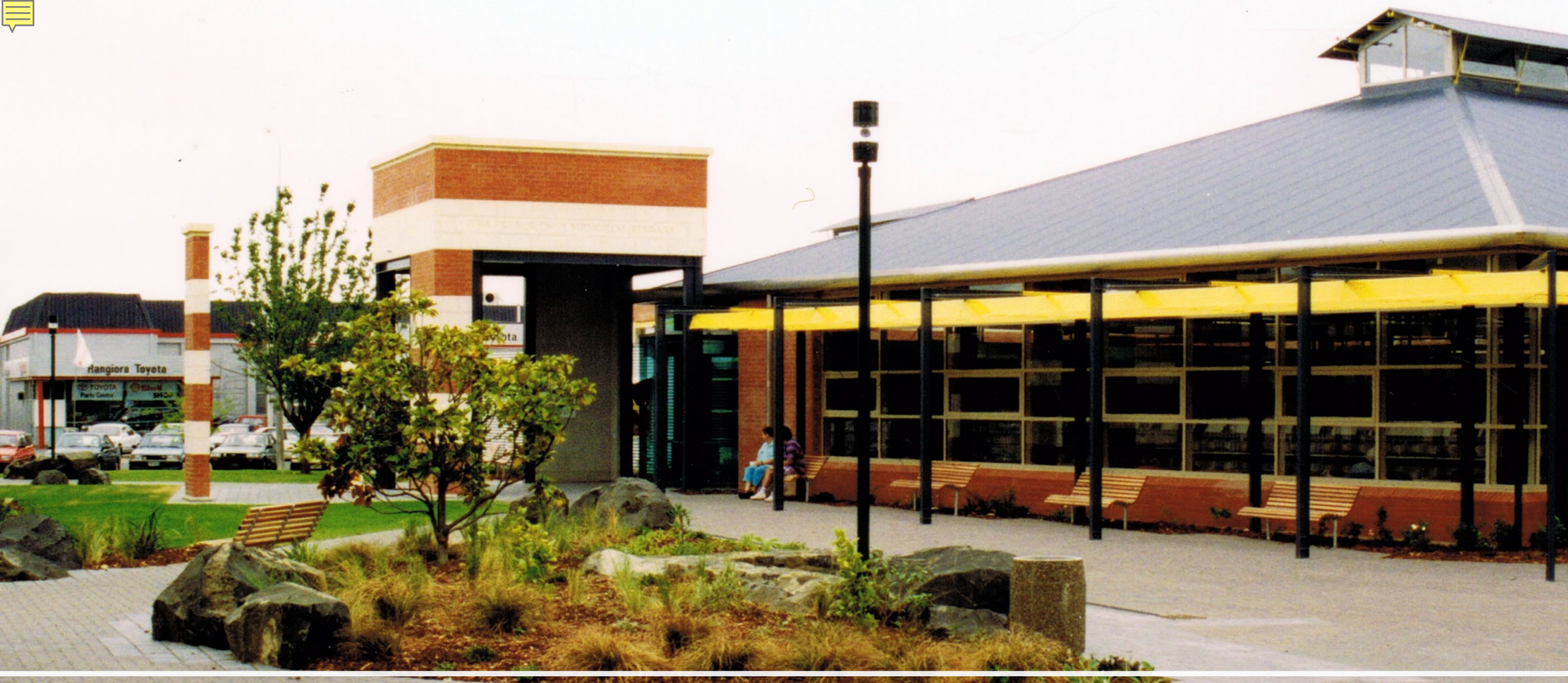
The Trevor Inch Memorial Library in 1996