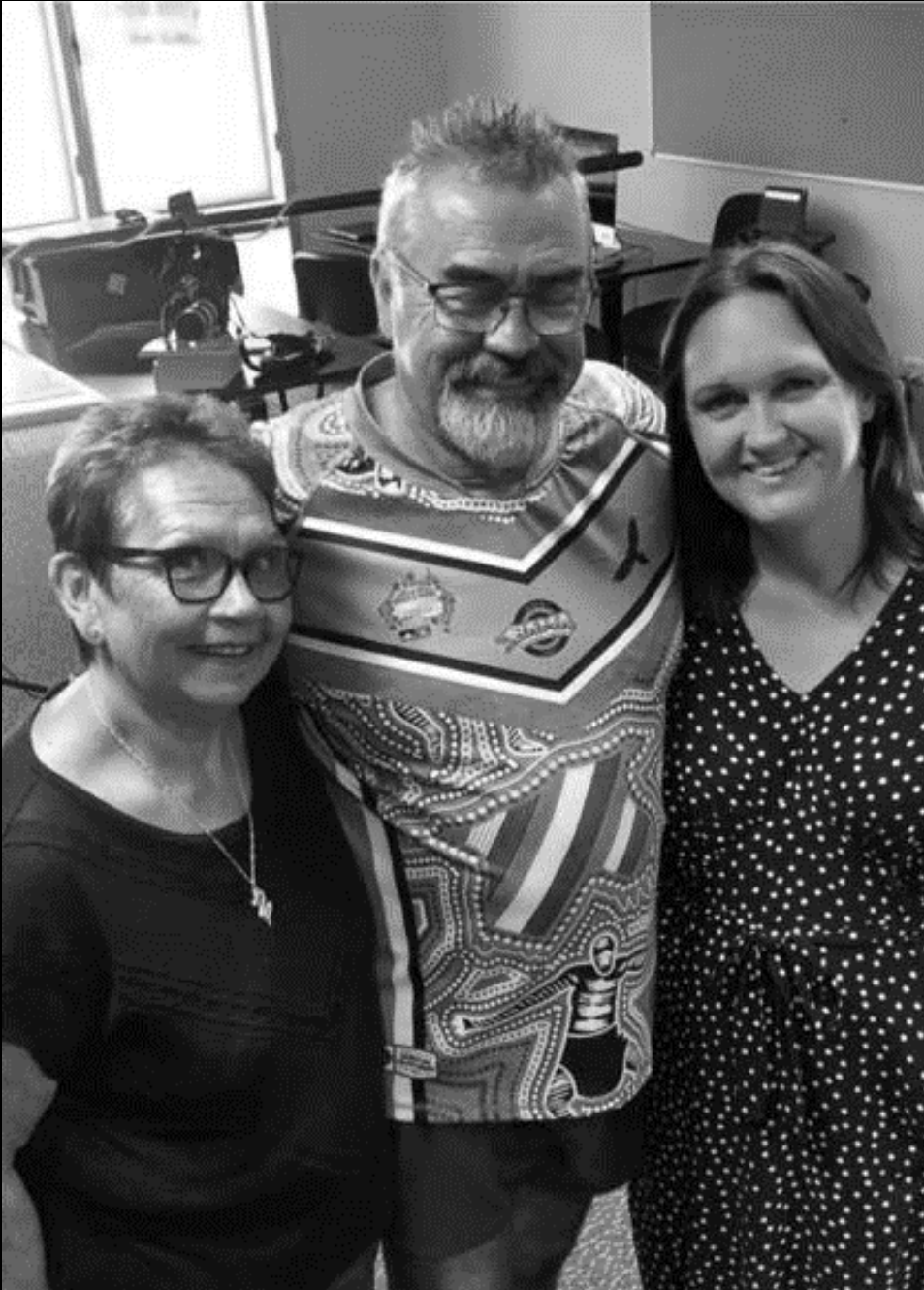
Photo: 2Rivers interviewing participants