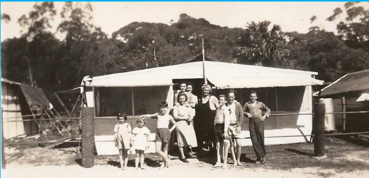
Shacks of the Royal National Park

The library had a collection of oral histories with people from the Bonnie Vale community as audio files hosted on our Illawarra Stories website. They can be downloaded or streamed. We linked these via QR codes displayed in the exhibition.